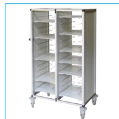
Plate-Rack Trolley, 30 shelves