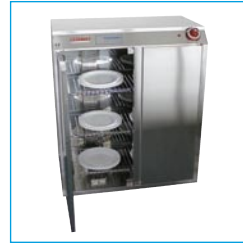
Plate warmer for 120 plates (Ø 33 cm)